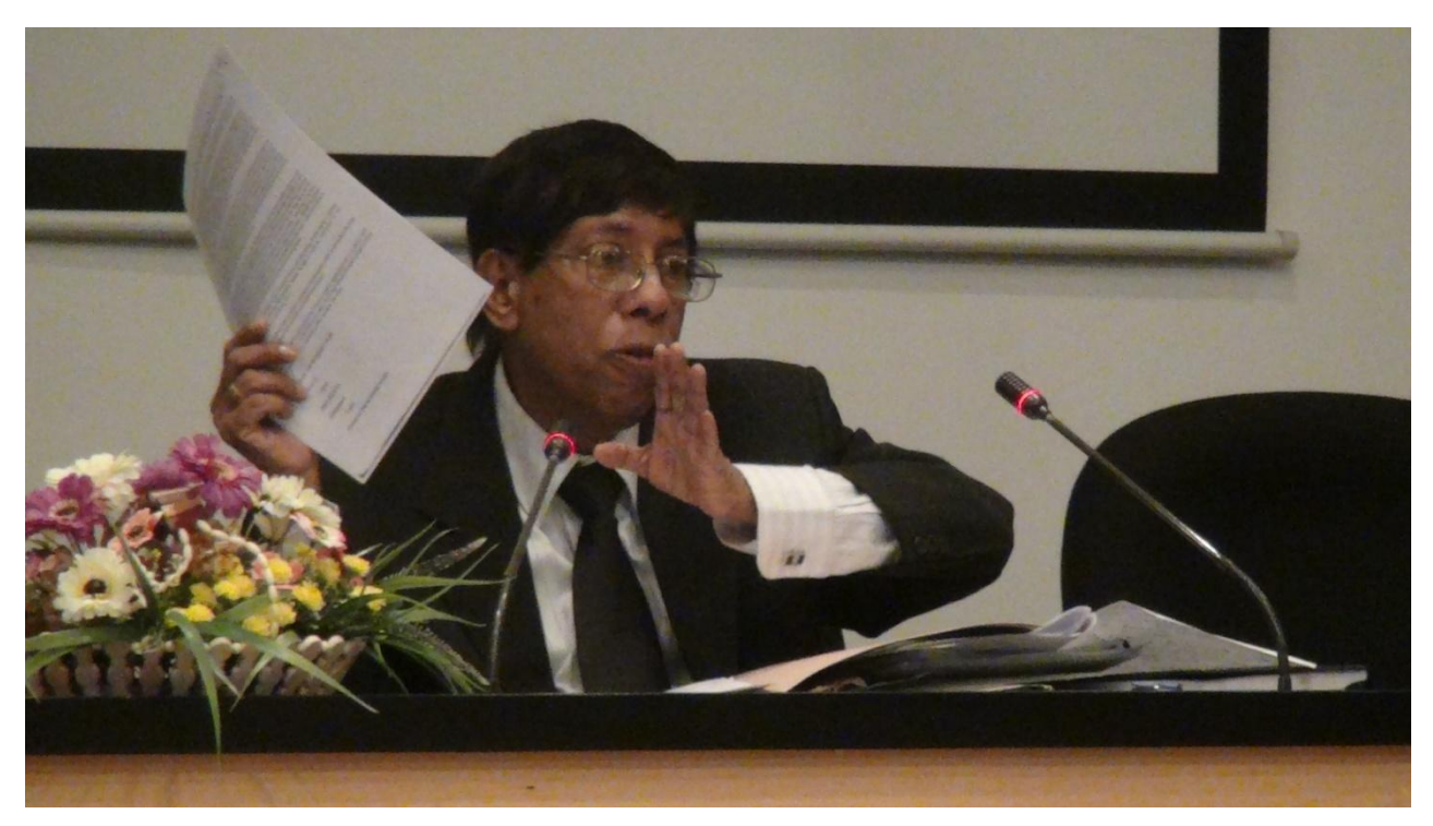
Justice P.H.K. Kulatilake conducting a seminar for newly recruited Judges