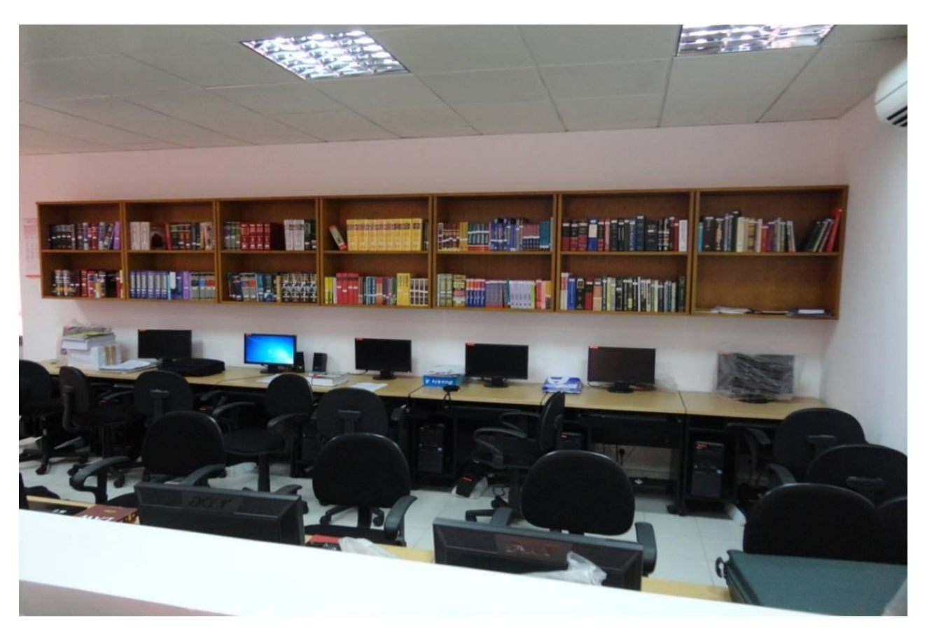
Computer Lab of the Sri Lanka Judges Institute