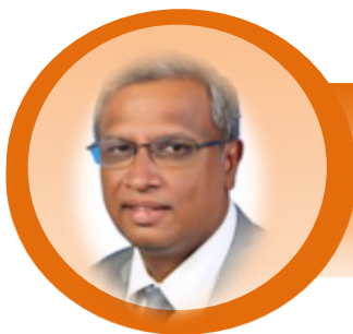
Hon. M. A. Sumanthiran