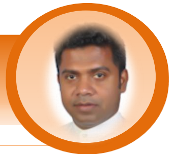
Hon. (Dr.) Nalinda Jayathissa